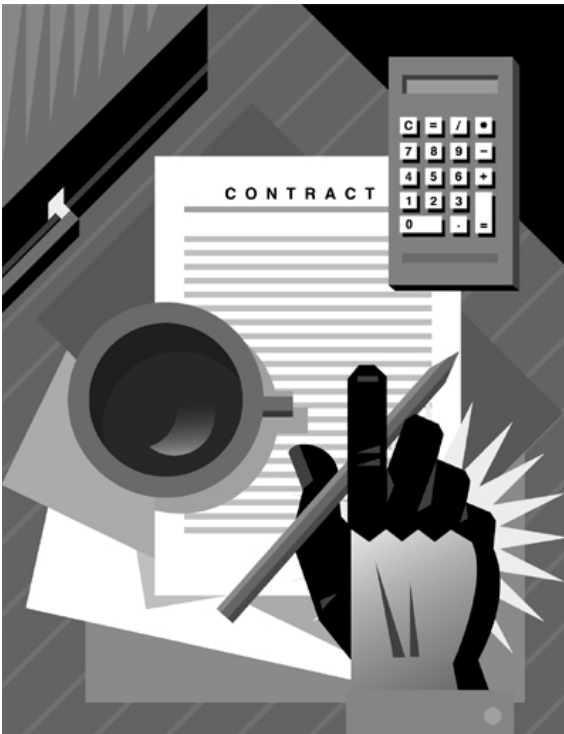
Training & Technical Assistance Services Western Kentucky University